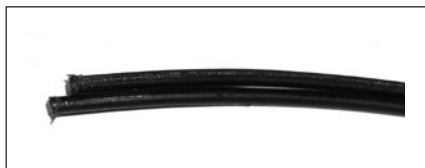
Color Code: Black-TXD, Blue-RXD