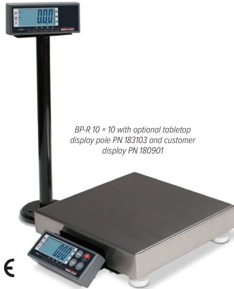
BP-R 10 × 10 with optional tabletop display pole PN 183103 and customer display PN 180901