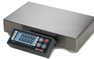
BP-R 06 × 10 scale