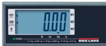
Customer display (optional)