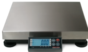
BP-R 12 × 14 scale