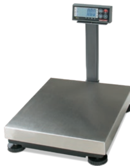
BP-R 12 × 14 scale with optional column bracket & post