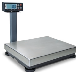
Shown with 174783