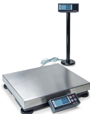
BP-P shown with 183103 and 180901