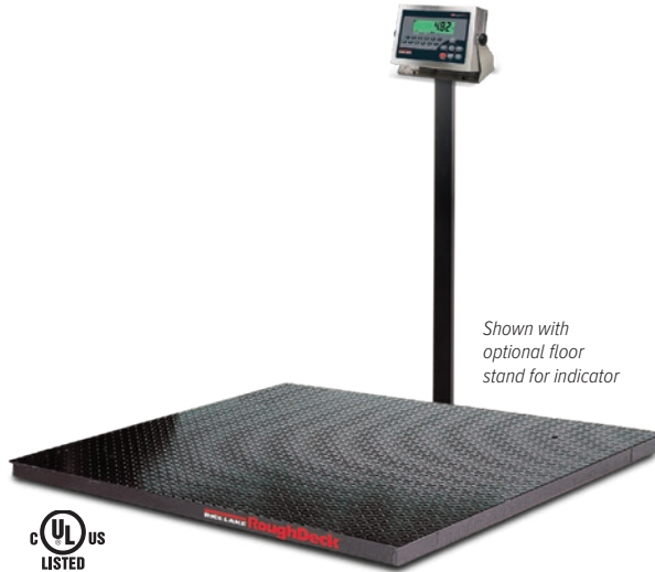
Shown with optional floor stand for indicator