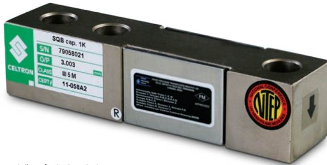
Picture is a representation of actual product