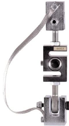
Module with RL20001HE S-beam load cell