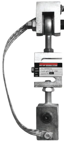
Module with RL20000I S-beam load cell

Picture is a representation of actual product.