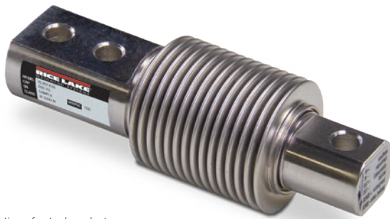
Picture is a representation of actual product.