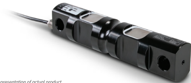
Picture is a representation of actual product.

Alloy Steel, Environmentally Sealed, NTEP Certified 1:5,000 Class III Multiple Cell, IP67