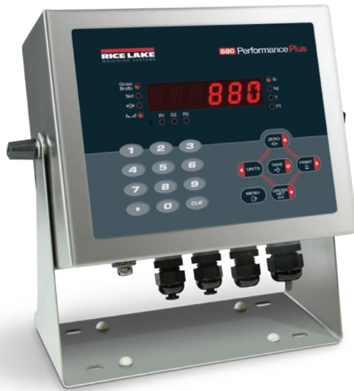
880 Plus Universal

Programmable Weight Indicator/Controller