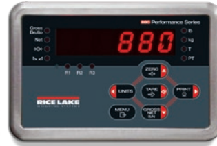
880 Panel Mount